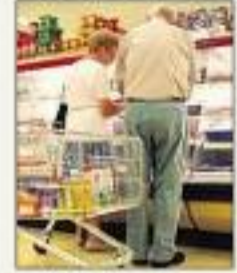
Hit hard... pensioners

THE elderly will be £315 worse off after George Osborne's bombshell Budget, a study warned yesterday. About 12million pensioners will be hit hard by the granny tax and VAT double whammy. The figures emerged yesterday as the backlash over the Chancellor's tax grab mounted. Senior advisers revealed they gave him FOUR options to cushion the blow for OAPs - but he dismissed them all. Mr Osborne is also under fire over child benefit cuts and slapping VAT on