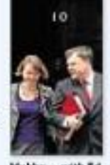
Hubby... with Ed