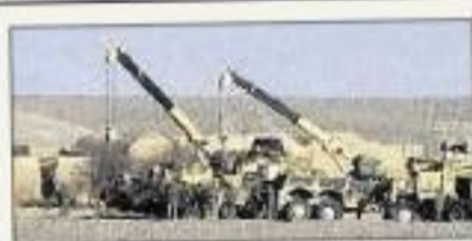
Pain... scene of blast where six were killed

THE head of our Army today tells Britain to stand firm in a passionate defence of the fight for peace in Afghanistan.